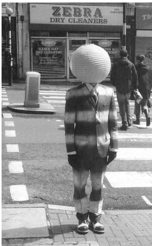
All morning he stands and flashes.