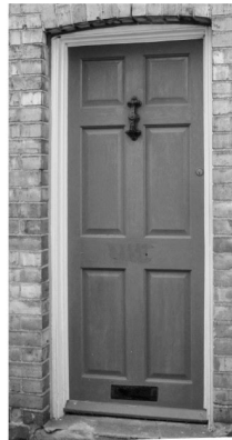
Campaign with a bang!