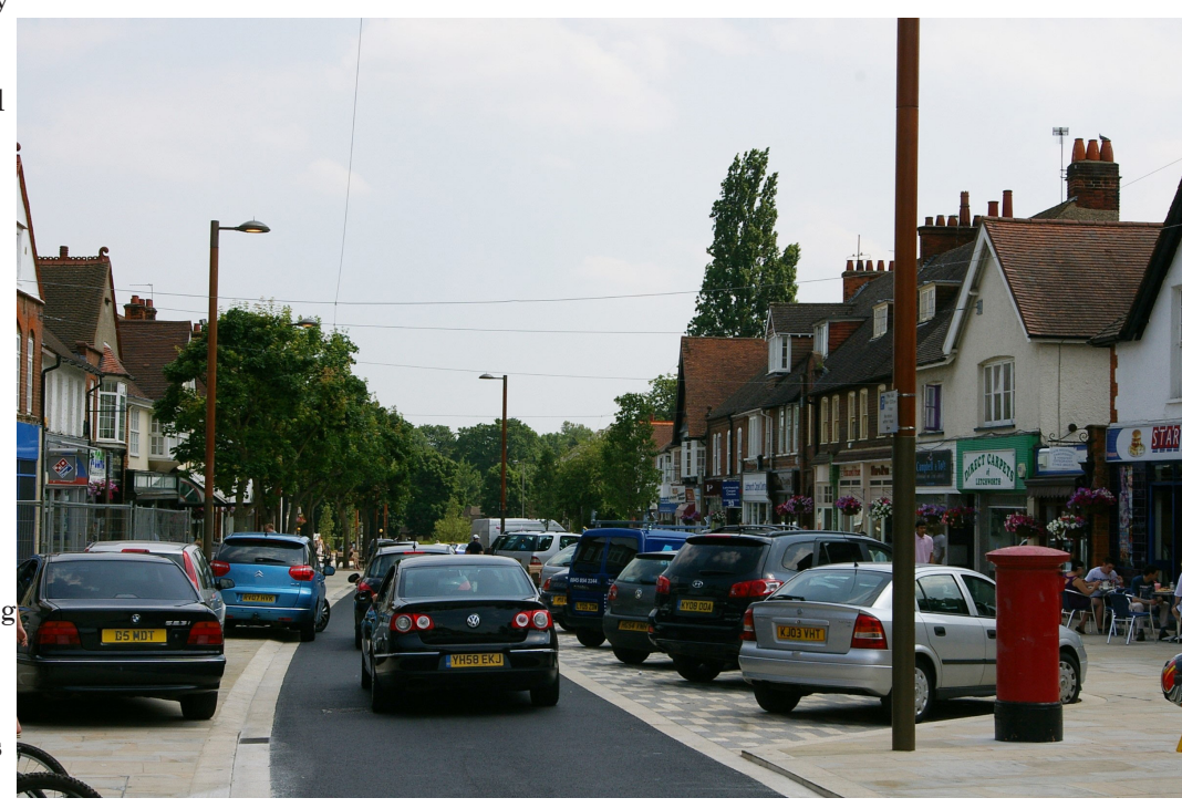
Letchworth - one of few garden cities to have been built

Some parts of the planning profession are still in thrall to garden city principles and the government, to show its greenfield obsession is not simply fuelled by housebuilder profit, has signed up to a programme of 'garden towns' and 'garden villages'. So far England has had 10 garden towns and 14 garden villages imposed and Wales has one official garden town, called